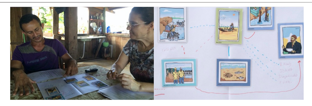
FIGURE 3 | Drawing of the perception of actors about the Madeira Fisheries System and a picture of the interview. The continuous blue link here represents the strong relation and the dashed red link represent the weak relation.