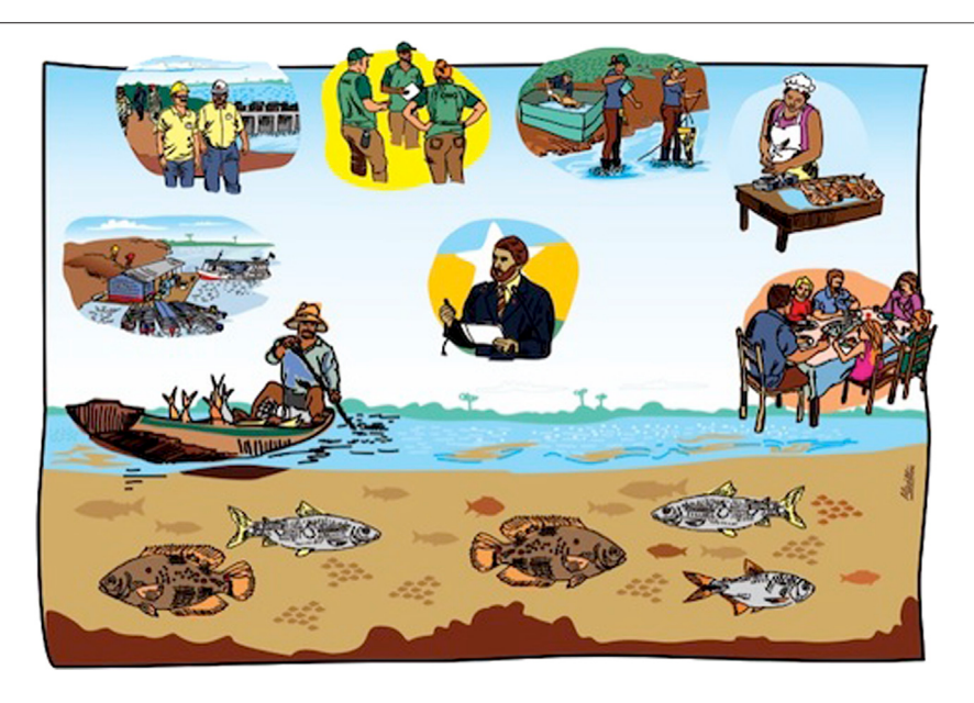
FIGURE 2 | Pictorial representation of the Madeira fisheries system used in the stakeholders' interviews and cognitive maps. Each of the insert in the map corresponded to a card, on the bottom the fishes, from left to right, from bottom to top: Fisher; Fishers colony or association; Hydropower Company; Non-governmental organization; Science; Middlemen; Consumers and in the middle the Government.

literature review, and by actual answers. New subthemes were created and coded based on the frequency with which they were cited (over three times). In the end, the codes were reviewed, refined, grouped (when possible) and classified into positive or negative analysis, represented by (+) and (-) in the Supplementary Material tables. For each descriptor, we considered the most frequent and relevant answers by group or for all respondents, when they corresponded to 20% or more of the answers.